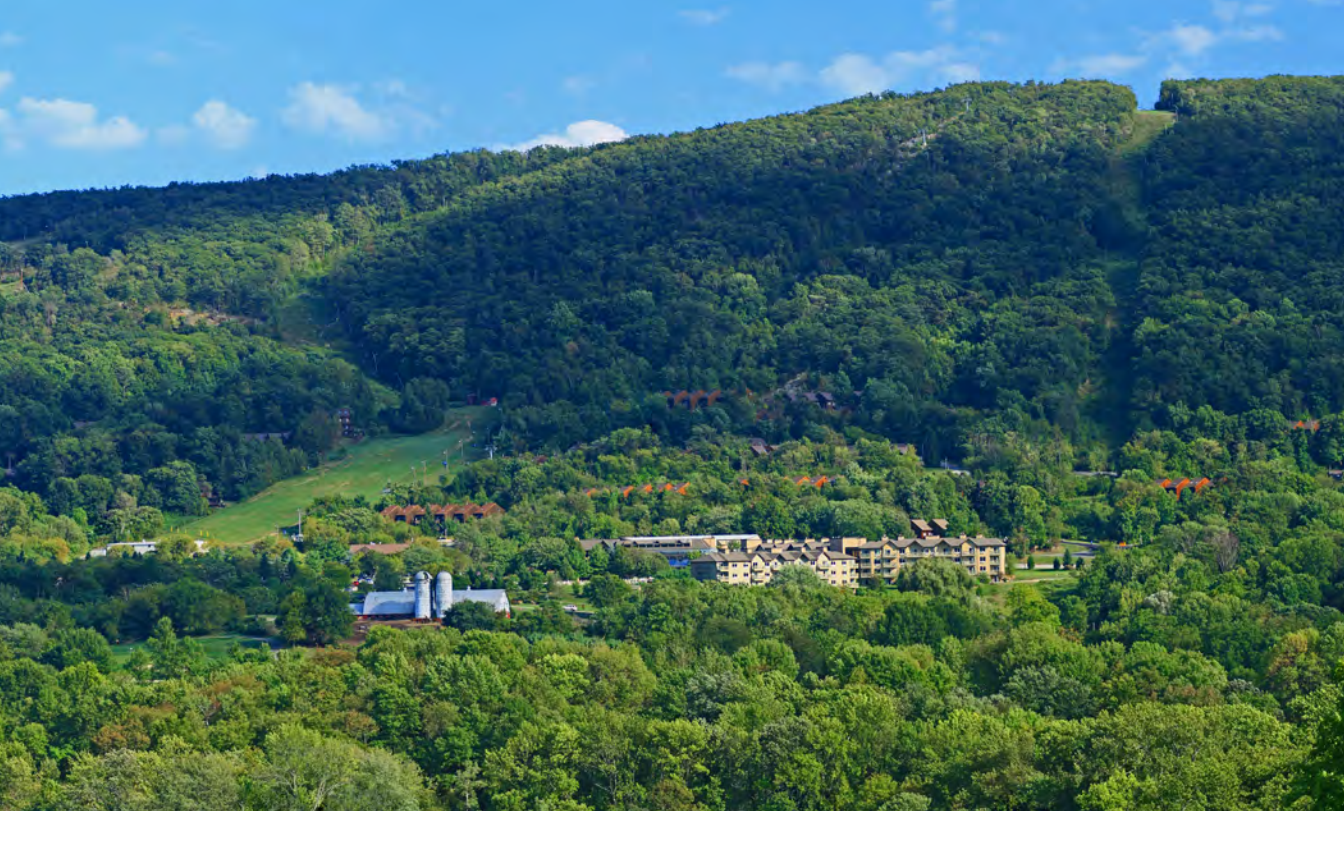
The MINERALS VACATION STAY PASS is your ticket to the ultimate summer playground in a stunning mountain setting. Minerals Hotel guests can enjoy access to the endless array of activities and amenities shown here.