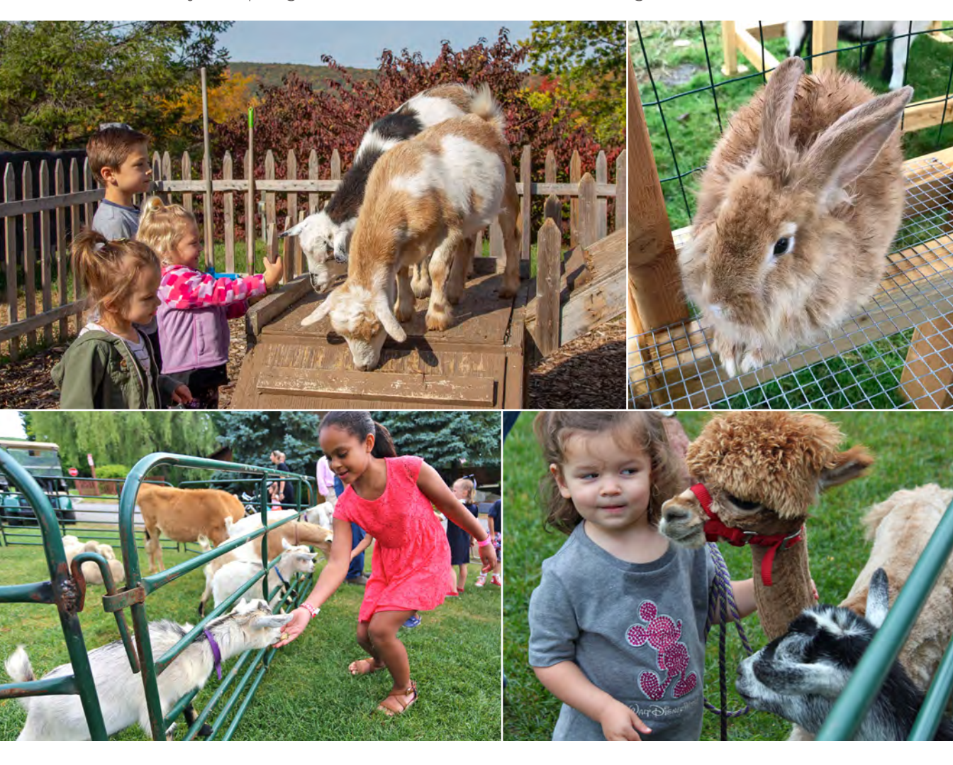
Farm Animal Visits GCL: Monday, Wednesday & Friday